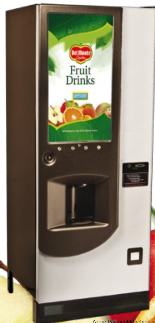
Azure Payment Machine shown

If you've noticed the benefits of encouraging healthier lifestyle and want to capitalise on the increasing demand for quality water products, the Azure point-of-use water dispenser from Westomatic is for you. Re-hydrate your staff and customers with an unlimited supply of pure still or sparkling twice-filtered, 'bottled at source' quality water at the touch of a button.