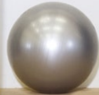
Shown with optional Platinum branding